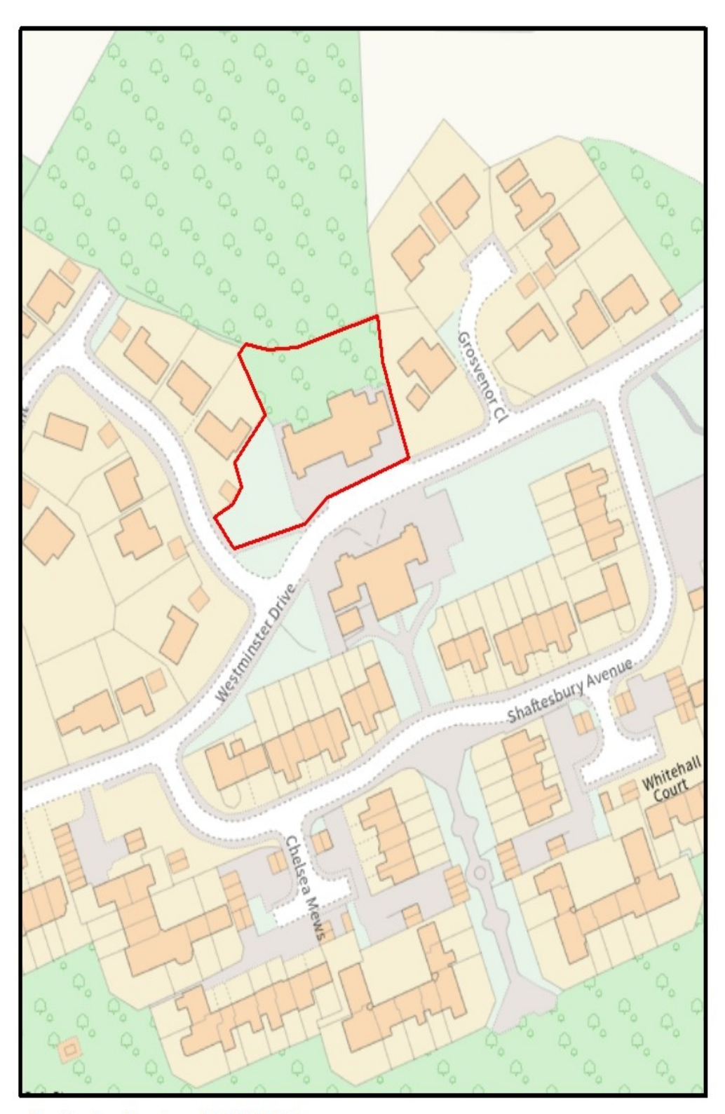
Application Number: 23/01605/FUL "Catalyst Church, Westminster Drive, Upper Saxondale